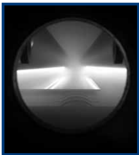
Magnetron Sputtered Process